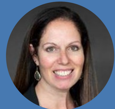
Commissioner Darcie L. Houck