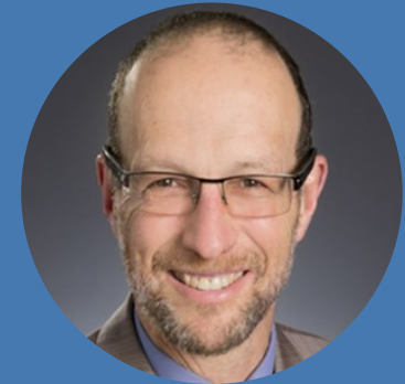
Commissioner Clifford Rechtschaffen