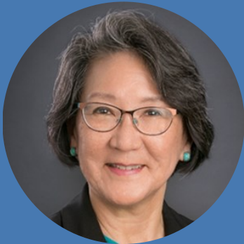
Commissioner Genevieve Shiroma