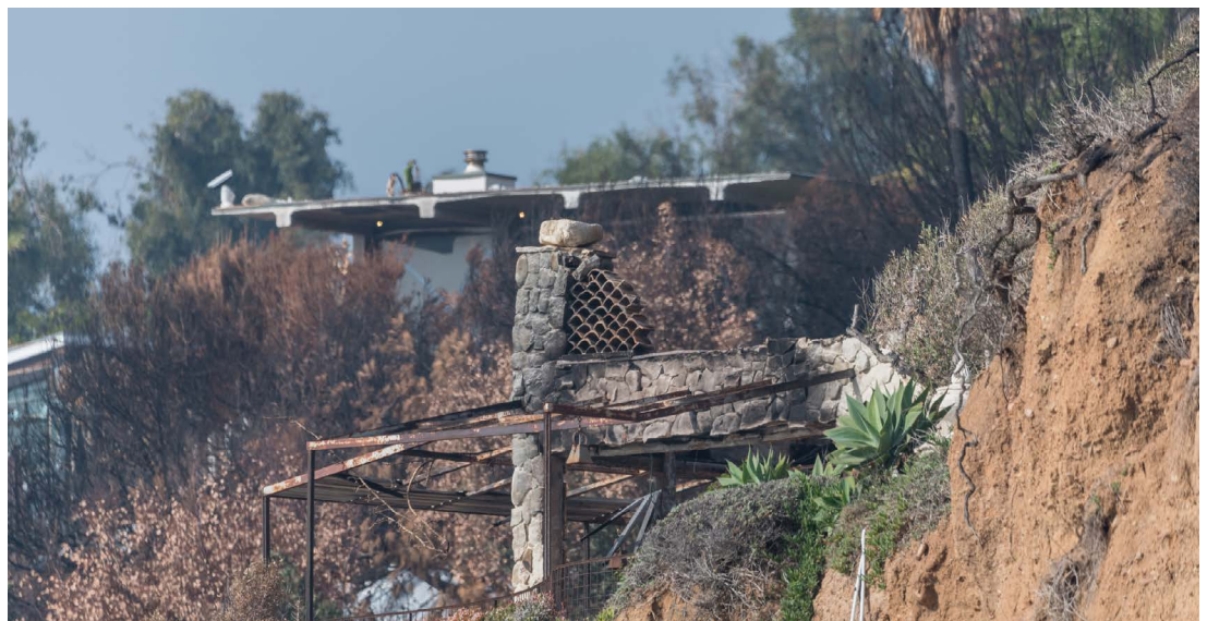
Topanga Canyon residents worry about getting out safely in a big wildfire, like the one that struck in nearby Malibu last year

To provide a sense of the complexity of the issues and the collaboration occurring, here is a partial list of people and agencies participating in the meeting at the Topanga Library in the center of town: Congressman Ted Lieu's Office, Assemblymember Richard Bloom's Office, State and Local CalOES, CAL FIRE, Los Angeles