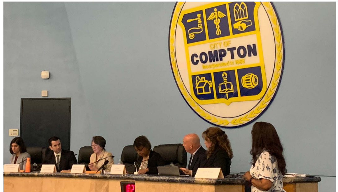
The Board's June meeting at the Compton City Council chambers

With both programs closing in on 2020 statutory goals for the number of participating households, the CPUC and LIOB are now asking regulated natural gas and electric utilities to propose new ways to make the programs more effective from 2021 on. As part of those efforts, the CPUC unanimously approved a deci-